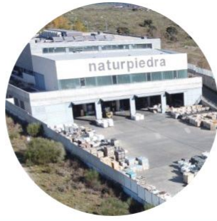
Warehouse and Distribution