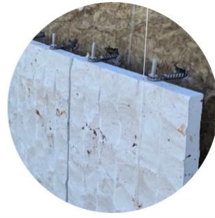
Supply and Installation