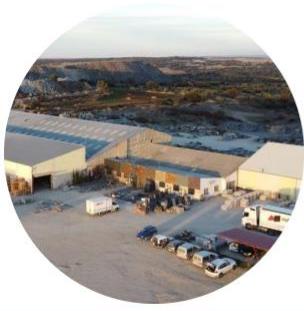
Quarries and Factory